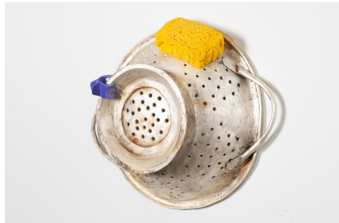
Colander with sponge and clip, 2021

Hydrocal gypsum, silver leaf, resin, fiberglass, acrylic paint 4 x 12 x 10 inches 10.16 x 30.48 x 25.4 centimeters