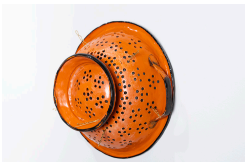
Colander with blonde bobby pins, 2021

Hydrocal gypsum, fiberglass, wire, epoxy putty, enamel and acrylic paint 4.5 x 11 x 10 inches 11.43 x 27.94 x 24.13 centimeters