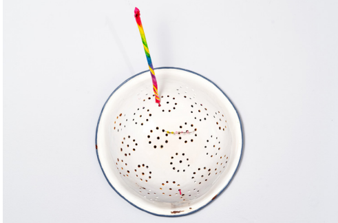
Colander with sparkler and fake braces, 2021

Hydrocal gypsum, fiberglass, wire, resin, tyvek, enamel and acrylic paint 8 x 12 x 9.5 inches 20.32 x 30.48 x 24.13 centimeters