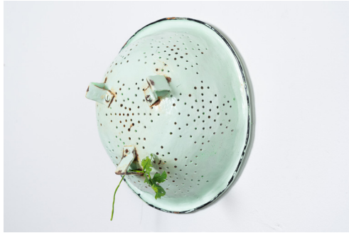
Colander with cilantro, 2021